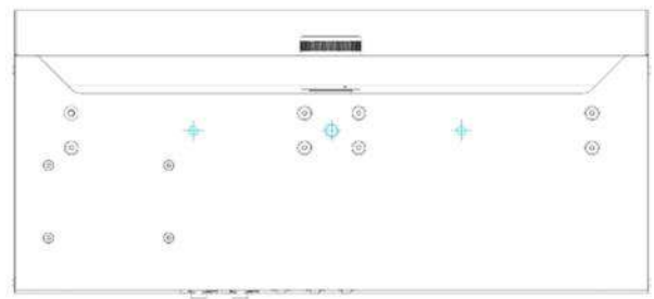
▲The bottom plate of the 4000 series – 1/4" UNC in the middle and M6 screw holes

The VE unit can be mounted via a 1/4" UNC threaded hole in the middle of the bottom plate to a tripod head for portable use. However, a common way of mounting the VE to a UTM is using two M6 screw holes with a 165 mm vertical span securing the system in a fixed position.