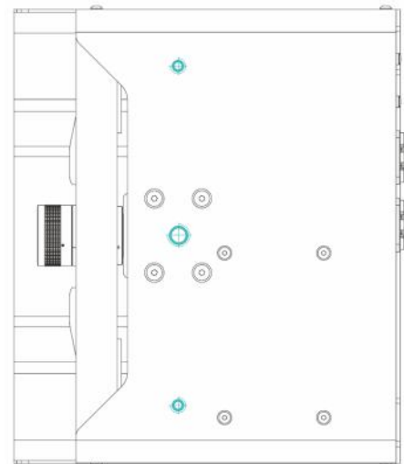
▲ The bottom plate of the 2000 Series - 1/4" UNC in the middle and M6 screw holes

The VE unit can be mounted via a 1/4" UNC threaded hole in the middle of the bottom plate to a tripod head for portable use. However, a common way of mounting the VE to a UTM is using two M6 screw holes with a 165 mm vertical span securing the system in a fixed position.